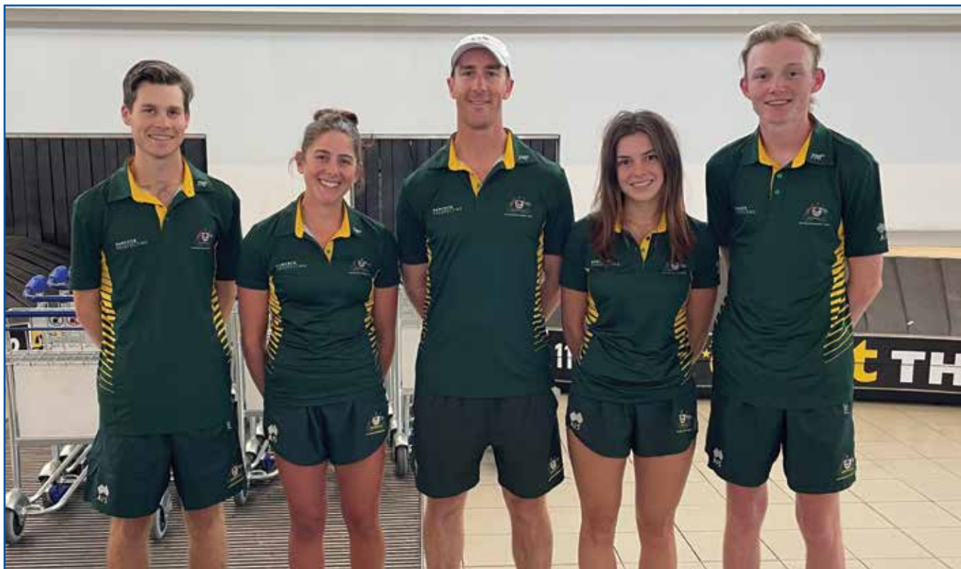
SRC Members in the Australian Under 23 Team 2023: