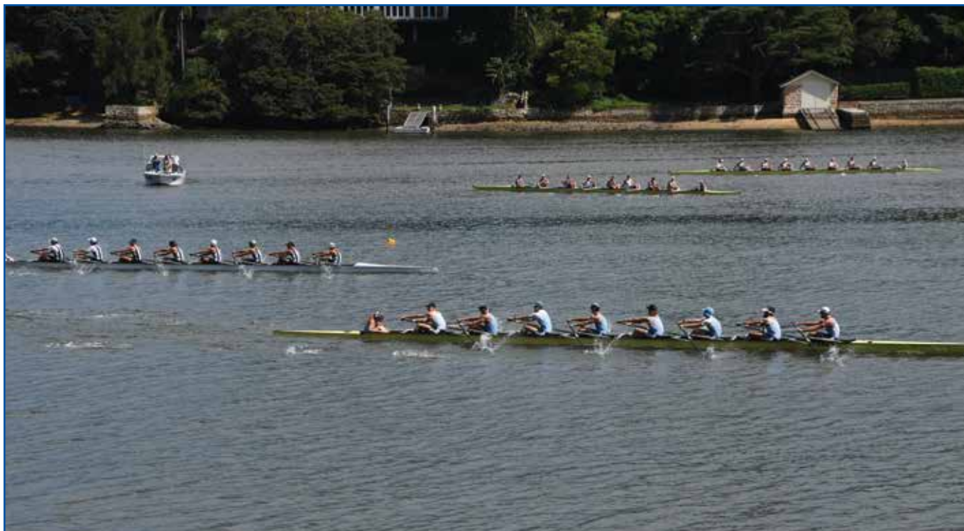
SRC Winning Riverview Gold Cup 2023